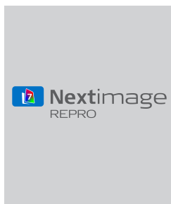
Nextimage Repro software